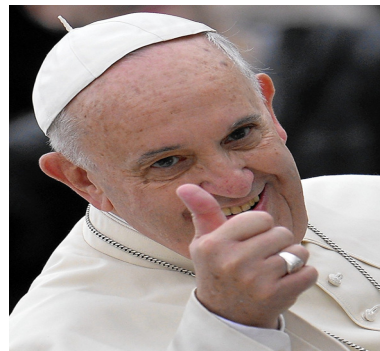
Our Holy Father Pope Francis Says:

Indeed, all parishes within the Diocese of Honolulu are restoring the Original Order of the Sacraments of Initiation between 2018-2020.